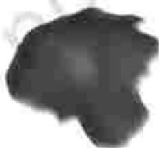
Fig. 3.3: Coal tar

It is a black, thick liquid (Fig. 3.3) with an unpleasant smell. It is a mixture of