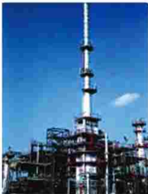
Fig. 3.5: A petroleum refinery

separating the various constituents/ fractions of petroleum is known as refining. It is carried out in a petroleum refinery (Fig. 3.5).