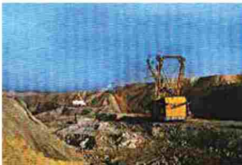
Fig. 3.2: A coal mine

When heated in air, coal burns and produces mainly carbon dioxide gas.