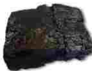
Fig. 3.1: Coal

You may have seen coal or heard about it (Fig. 3.1). It is as hard as stone and is black in colour.